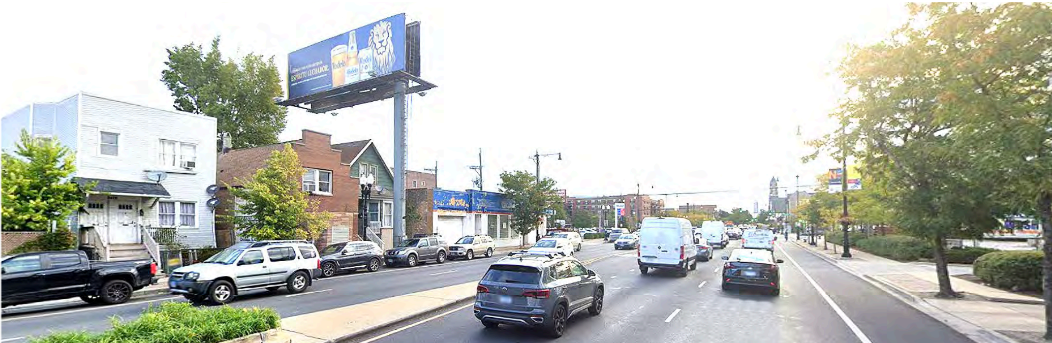
IRVING PARK RD EB AT WESTERN AVE FW 14'X48' TRAFFIC EB TO WRIGLEYFIELD AHEAD FROM 9094 EXPWY, NORTHSIDE TRAFFIC, NIGHTLIFE, BARS, RESIDENTIAL