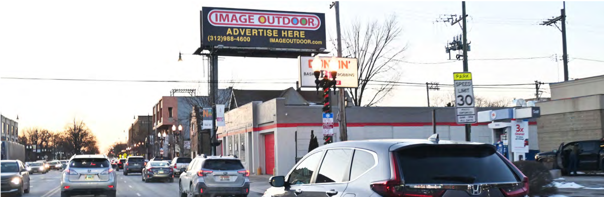
IRVING PARK RD WB OUTBOUND AT WESTERN AVE NB / SB FE 14'X48' NORTHSIDE CHICAGO TRAFFIC, VICINITY OF WRIGLEY FIELD, NIGHTLIFE, BARS, ENTERTAINMENT