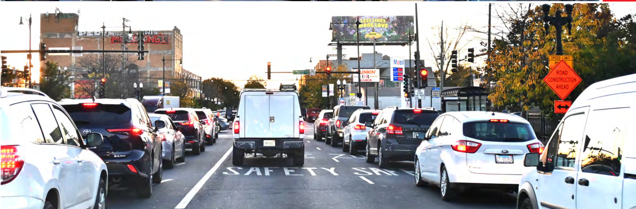
IRVING PARK RD WB OUTBOUND AT WESTERN AVE NB / SB FE 14'X48' NORTHSIDE CHICAGO TRAFFIC, VICINITY OF WRIGLEY FIELD, NIGHTLIFE, BARS, ENTERTAINMENT