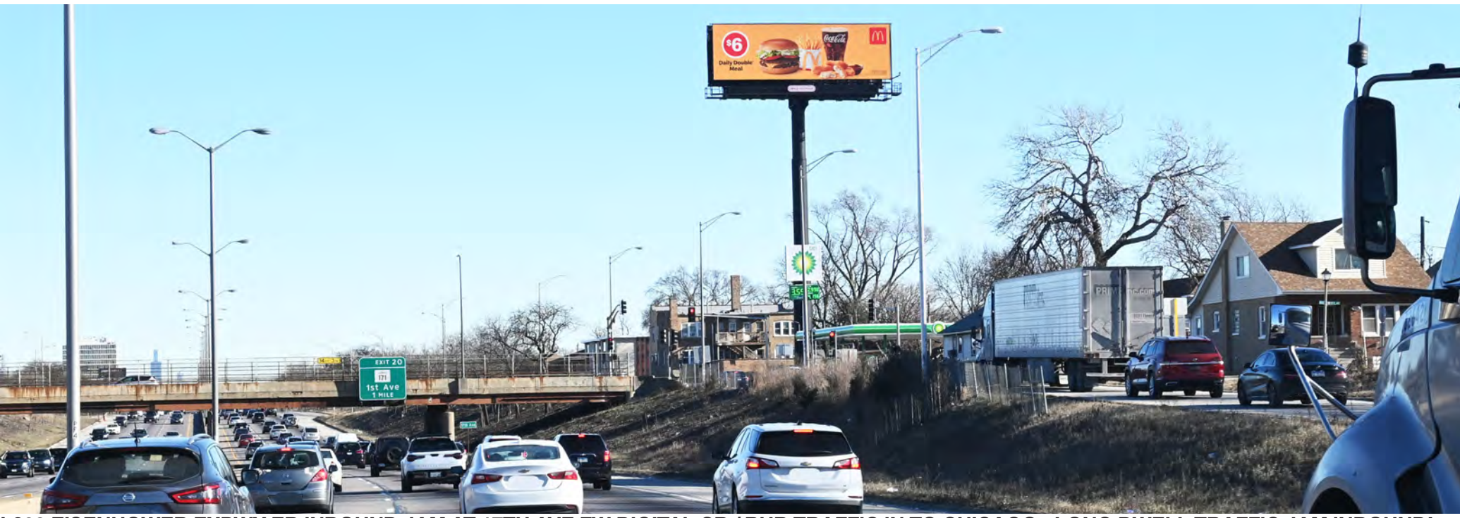
I-290 EISENHOWER EXPWY EB INBOUND JAM AT 17TH AVE FW DIGITAL CR / RHR TRAFFIC IN TO CHICAGO - LONG DWELL TRAFFIC JAM INBOUND!