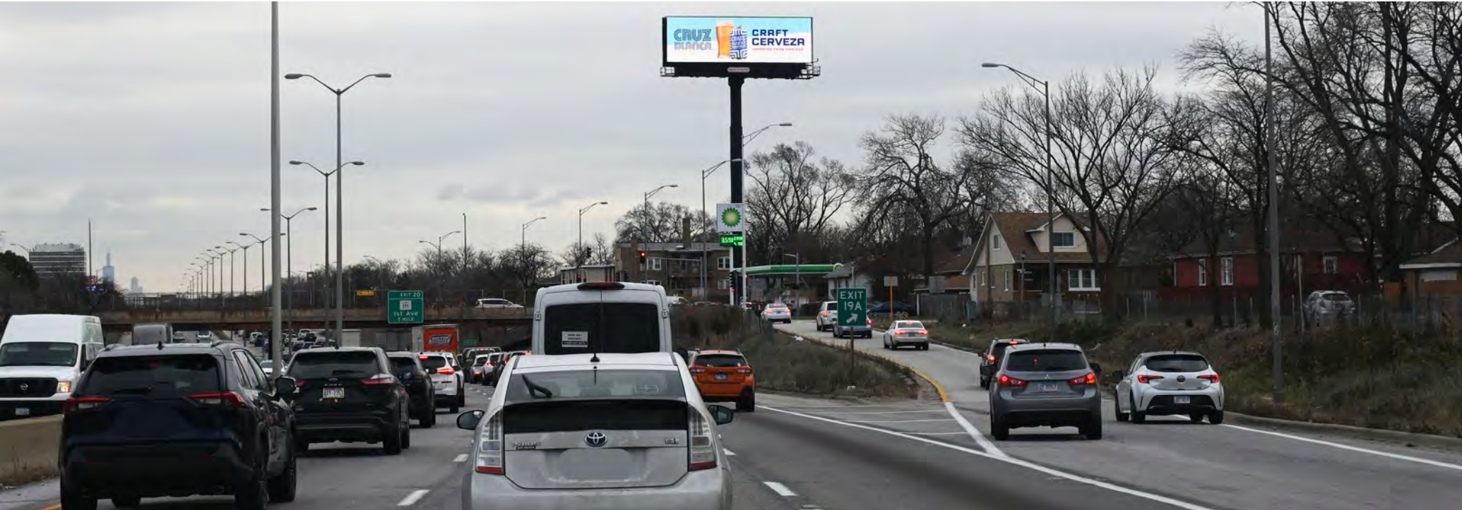
I-290 EISENHOWER EXPWY EB INBOUND JAM AT 17TH AVE FW DIGITAL CR / RHR TRAFFIC IN TO CHICAGO - LONG DWELL TRAFFIC JAM INBOUND!