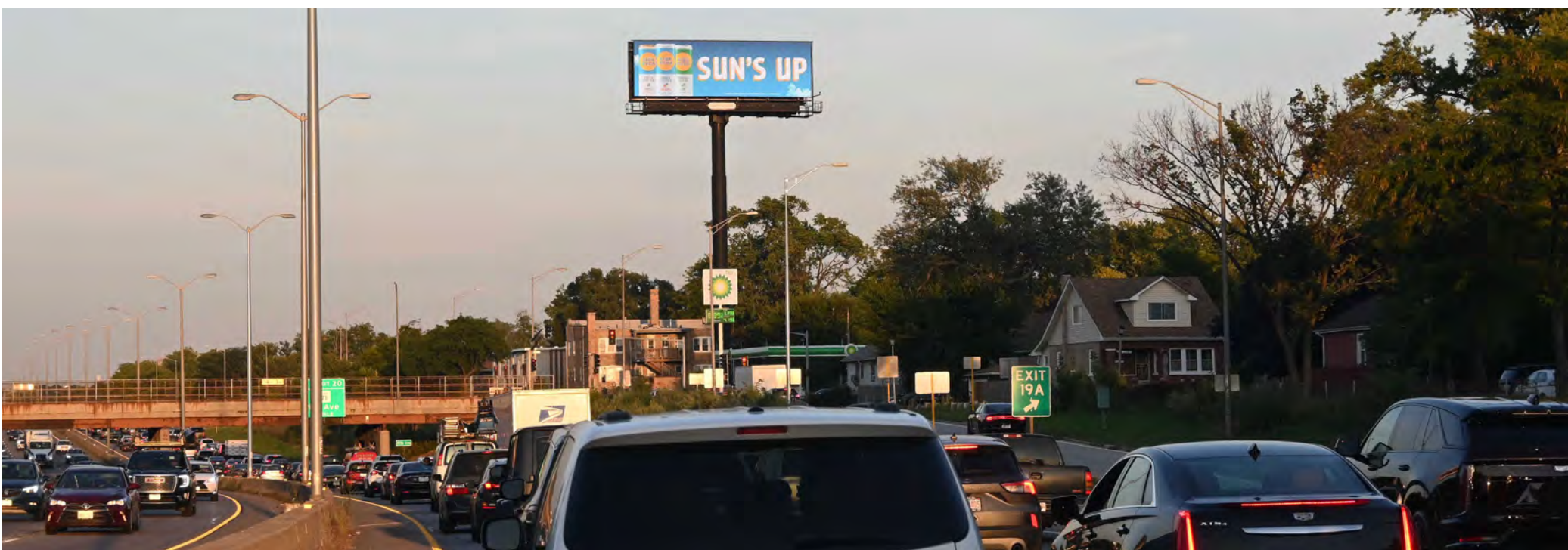
I-290 EISENHOWER EXPWY EB INBOUND JAM AT 17TH AVE FW DIGITAL CR / RHR TRAFFIC IN TO CHICAGO - LONG DWELL TRAFFIC JAM INBOUND!