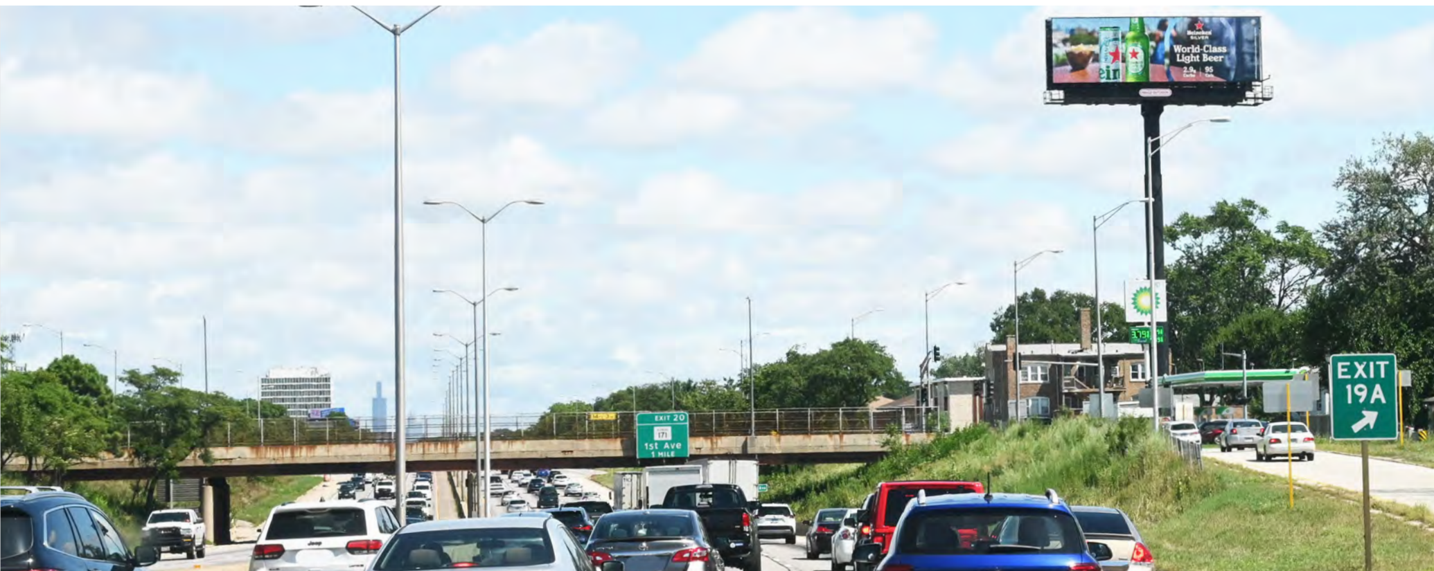
I-290 EISENHOWER EXPWY EB INBOUND JAM AT 17TH AVE FW DIGITAL CR / RHR TRAFFIC IN TO CHICAGO - LONG DWELL TRAFFIC JAM INBOUND!