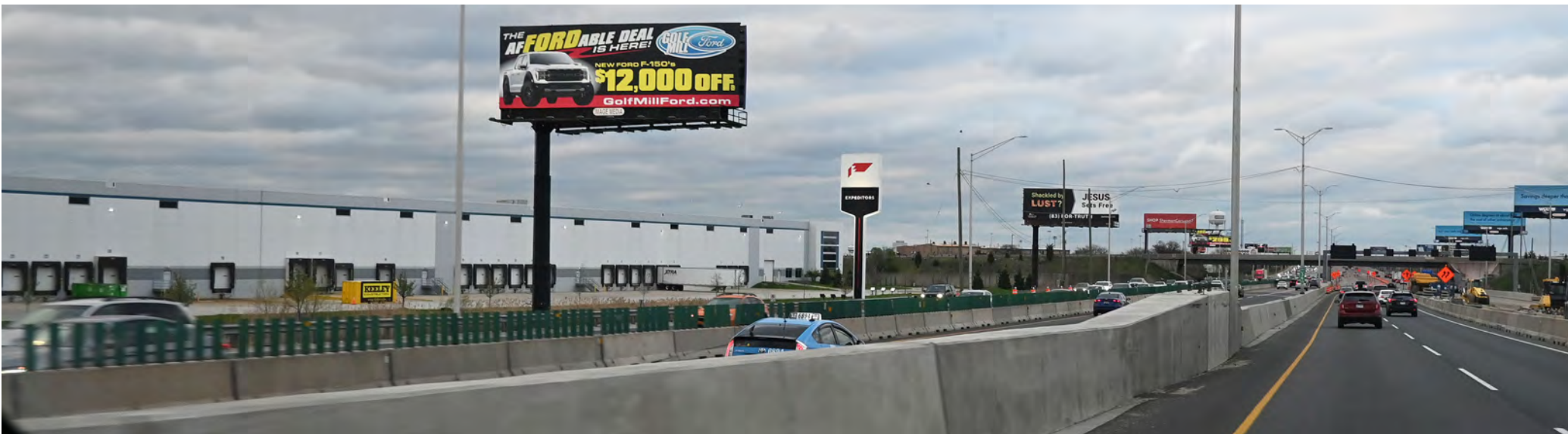
I-294 TRI-STATE TOLLWAY NB AT S/O WOLF RD. FSW 20'X60' NB TO ROSEMONT, I-90, I-190 ORD O'HARE AIRPORT, I-90/94 AHEAD