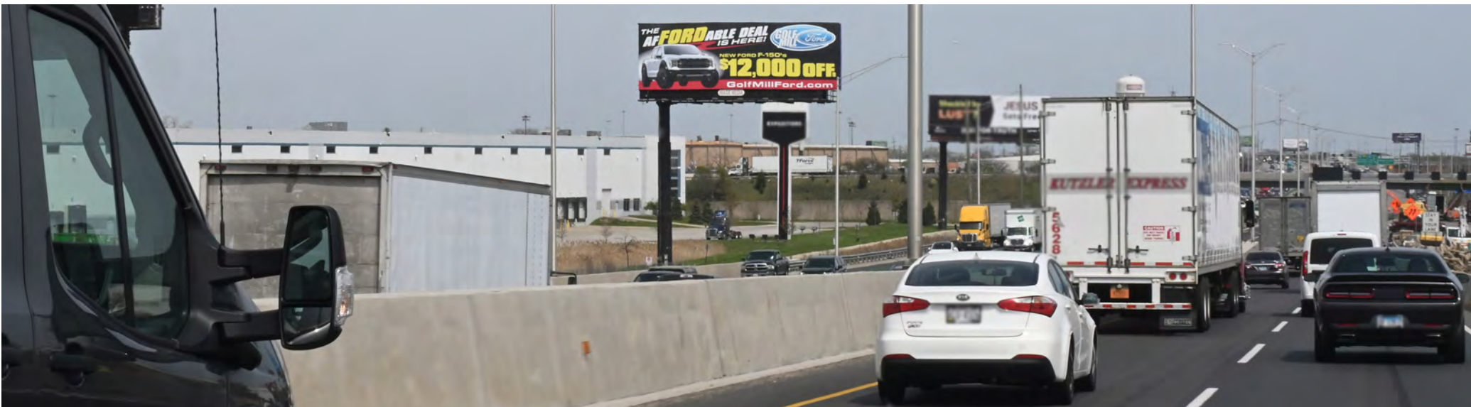
I-294 TRI-STATE TOLLWAY NB AT S/O WOLF RD. FSW 20'X60' NB TO ROSEMONT, I-90, I-190 ORD O'HARE AIRPORT, I-90/94 AHEAD