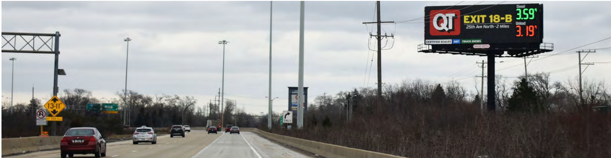
I-290 EISENHOWER EXPRESSWAY EB AT I-294/I-88 FW 20'X60' TRAFFIC INBOUND TO CHICAGO FROM WEST SUBURBS RHR CLOSE TO NEXT EXIT MANNHEIM RD.