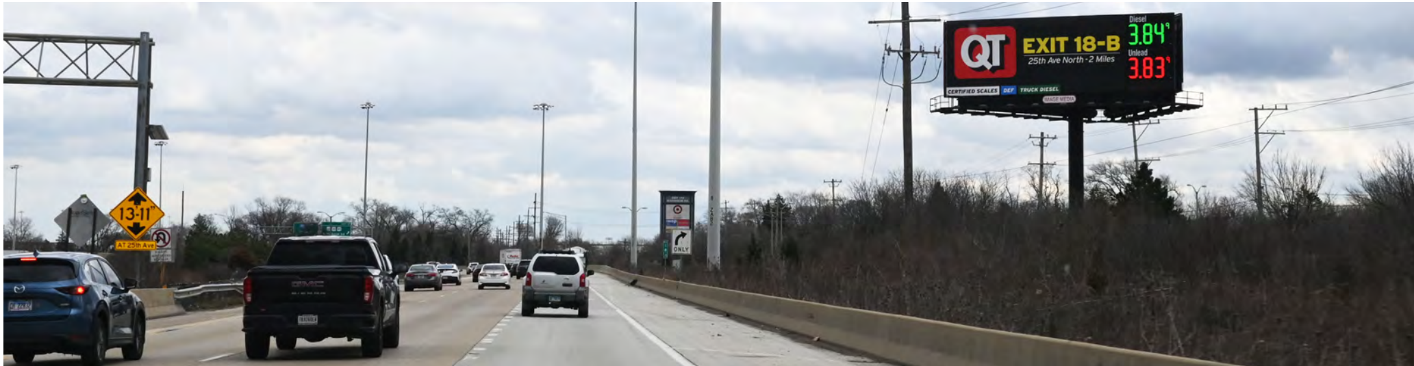
I-290 EISENHOWER EXPRESSWAY EB AT I-294/I-88 FW 20'X60' TRAFFIC INBOUND TO CHICAGO FROM WEST SUBURBS RHR CLOSE TO NEXT EXIT MANNHEIM RD.