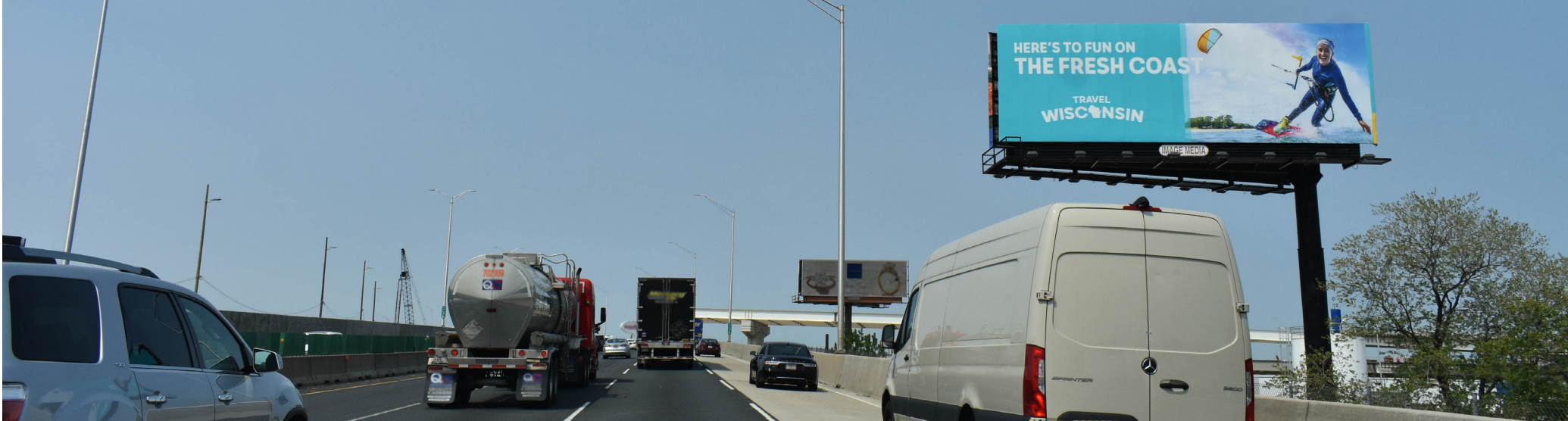
I-294 TRI-STATE TOLL SB S/O WOLF RD FE 20'H X 60'W RHR TRAFFIC FROM ROSEMONT, ORD O'HARE AIRPORT SB TO I-290, I-88, NORTH AVE.