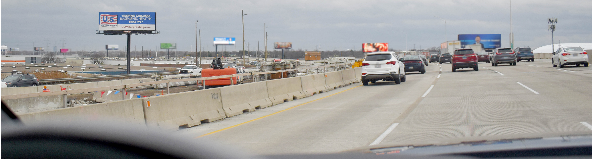
I-294 TRI-STATE TOLL SB AT GRAND AVE FNE 20'H X 60'W LHR TRAFFIC FROM ROSEMONT, O'HARE AIRPORT SB TO I-290, I-88, NORTH AVE.