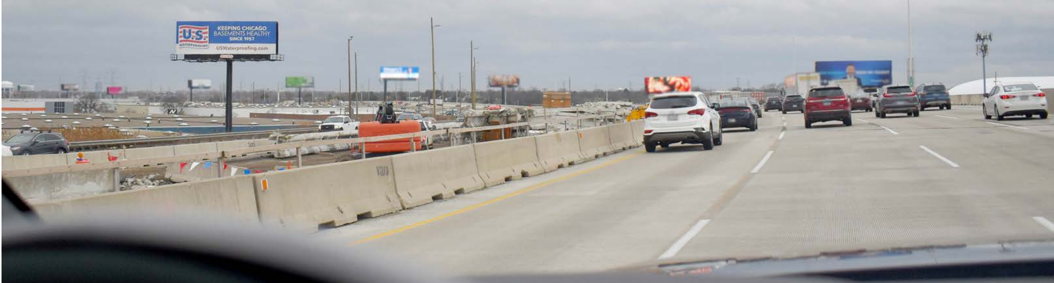
I-294 TRI-STATE TOLL SB AT GRAND AVE FNE 20'H X 60'W LHR TRAFFIC FROM ROSEMONT, O'HARE AIRPORT SB TO I-290, I-88, NORTH AVE.